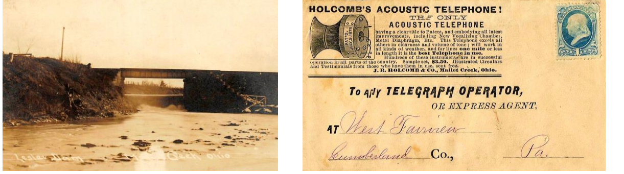
Mallet Creek: Lester Dam Bridge c. 1910

MALLET CREEK at Rte 18 and 252/57 in York Township. Established as Mallett Creek Post Office on 20 July 1837, name changed to Mallettcreek Post Office on 1 December 1895. Name changed back to Mallett Creek Post Office on 1 December 1905, discontinued on 31 May 1926