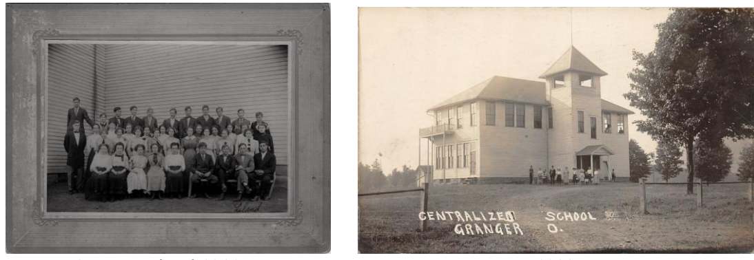
Granger school 1911.