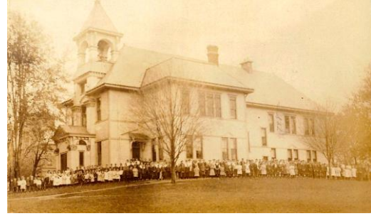
LeRoy School 1908

LeROY post office established 1825. Became Westfield Center in 1971.