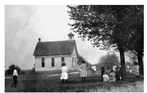
1923 photo of Beebetown School built 1872

BEEBETOWN At Boston and Marks Roads. Post office 15 February 1889 to 30 August 1902.